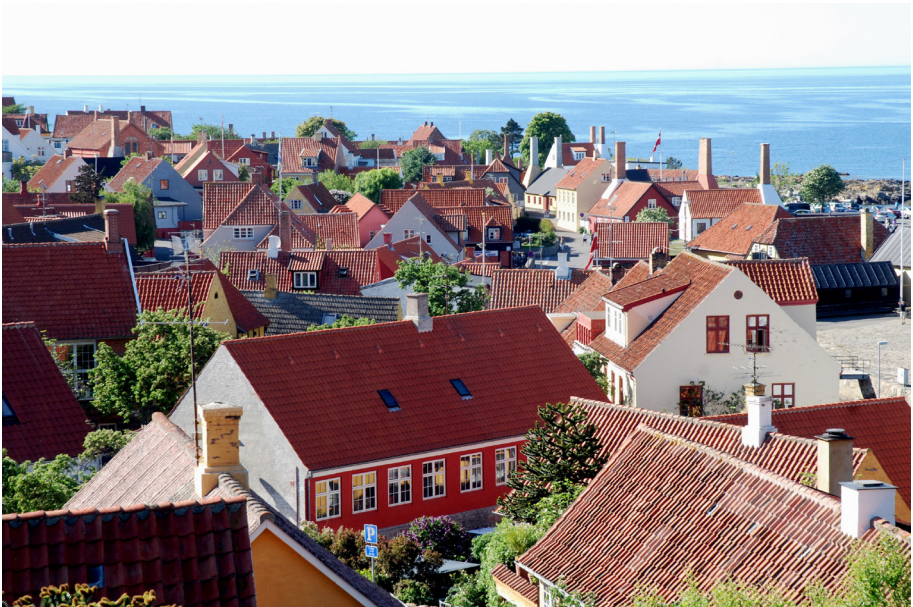
Island of Bornholm.

The northernmost point, not including Greenland and the Faroe Islands, is Skagen, the tip of Jutland, while the easternmost part is the island of Bornholm, located squarely in the West Baltic.