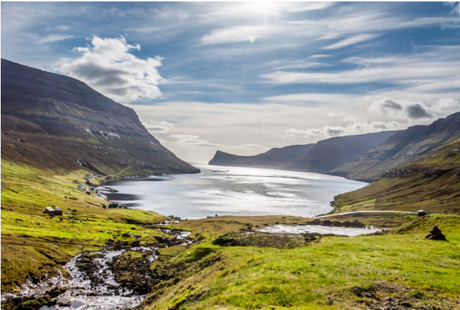
The Faroe Islands

This geography stands in stark contrast to the Faroe Islands and Greenland, which are part of the Danish 'Commonwealth', literally translated into the Danish Realm Community. The Faroe Islands, midway between Denmark and Iceland, are a set of rocky and rugged islands of 540 square miles with a population of 48,700, a large fishing industry and a smaller pastoral sheep-herding culture. Greenland is a vast, Arctic area, consisting of 839,109 square miles and 55,000 inhabitants. It is the world's largest non-continental island, its capital Nuuk nestled on the south-western shoreline, and most of it covered by the Greenland ice sheet. All population centres are on the coast, with the population concentrated on the western coast.